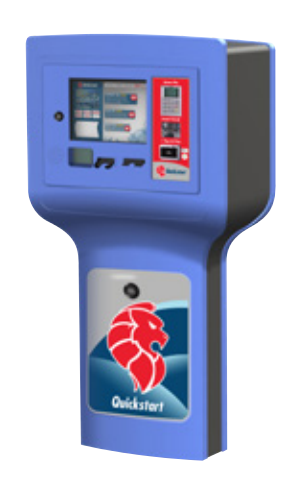
Auto Sentry® Petro