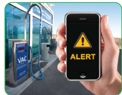
You may configure the units to send alerts to the most appropriate people.